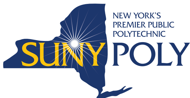
Two-color New York State Graphic for light background