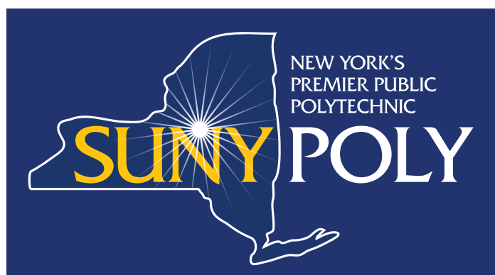
Two-color New York State Graphic for dark background

The New York State graphic is another secondary mark used in special marketing projects to promote SUNY Poly being New York's Premier Public Polytechnic.